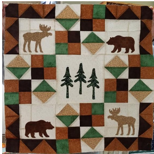
"Go to the Northwoods" Wall Hanging 28" x 28" Kits Available with Die Cuts