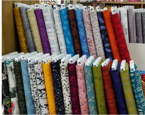
NEW**Art History 101 from Windham Fabrics**NEW