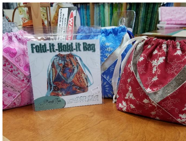
"Fold it Hold it Bags" by Pieced Tree Patterns