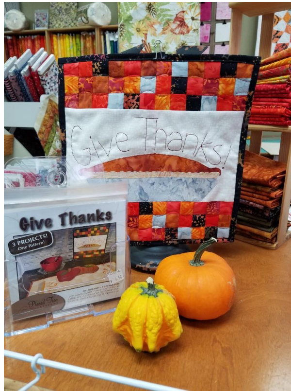
"Give Thanks" by Pieced Tree Patterns